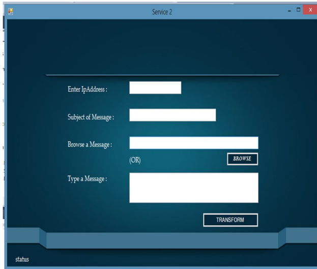
Fig 2: Client Service 2

The form Client Service 2 get an IP address, subject of message and a message to transform from Client Service 2 (refer fig 2) to the Service Provider by clicking Transform button.